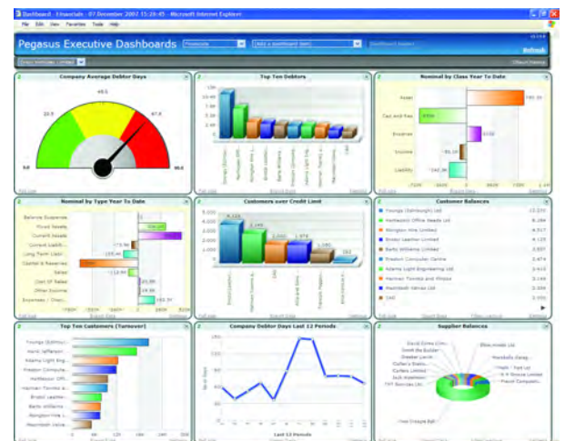
Financial Directors Dashboard