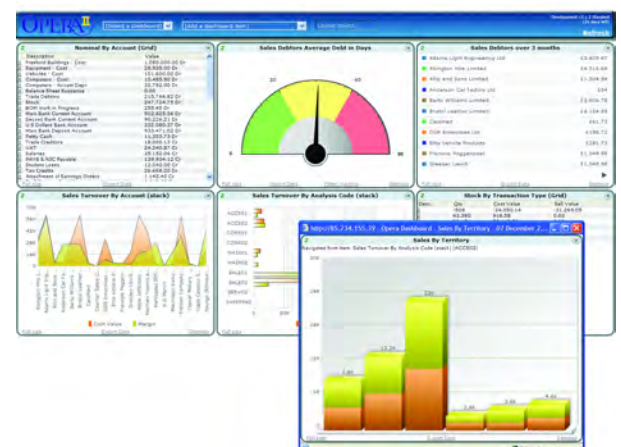
Sales Directors Dashboard