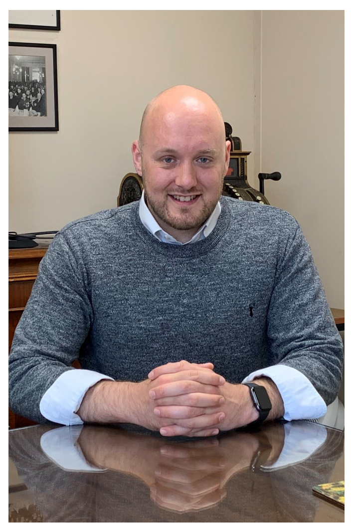
L W Cole specialise in installing appliances to the UK house building community.